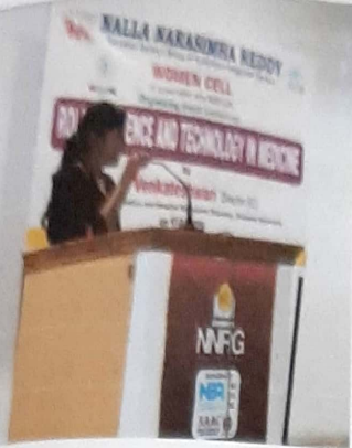
Welcome by Ist B.Tech student