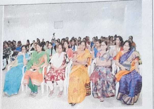
Girls & Women Faculty of NNRG