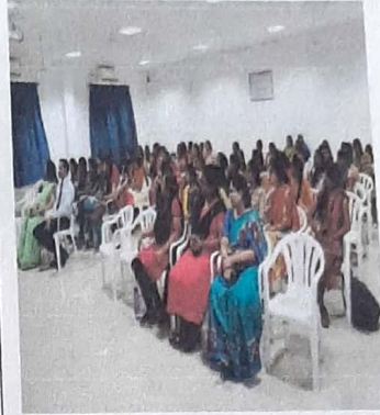
Girl & Women Faculty of NNRG