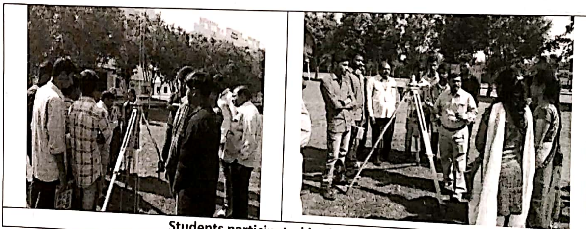
Students participated in the session