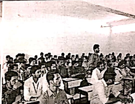
Students in the certificate Program