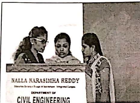
Prayer Song By IV Year Civil Engineering Students