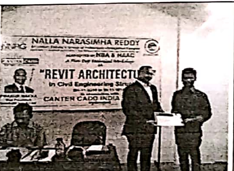
Distribution of Certificates by the Chief Guest & the Director