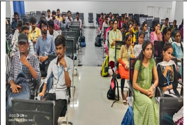
ECE students of II & III years