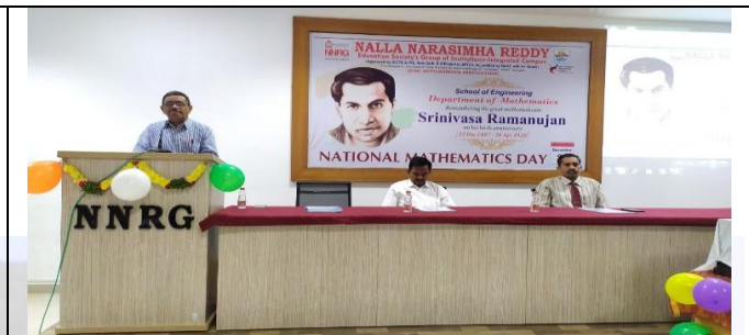
HOD (H&S) Sir addressing the students