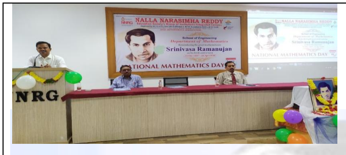
Director Sir addressing the students