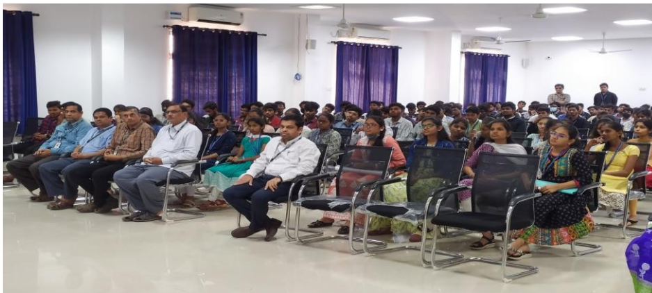
Watching video presentation of Srinivasa RamanujanLifeHistory and few applications of mathematics” By The director,Dean,HODS and I-B.Tech students