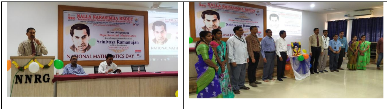
Mathematics faculty group photo with the Director, Dean and Department HODS