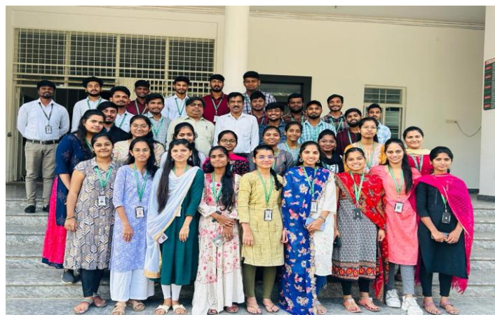
Field Visit to RK Math, students of B. Pharmacy (33) have participated in the visit on 11.01.2024.