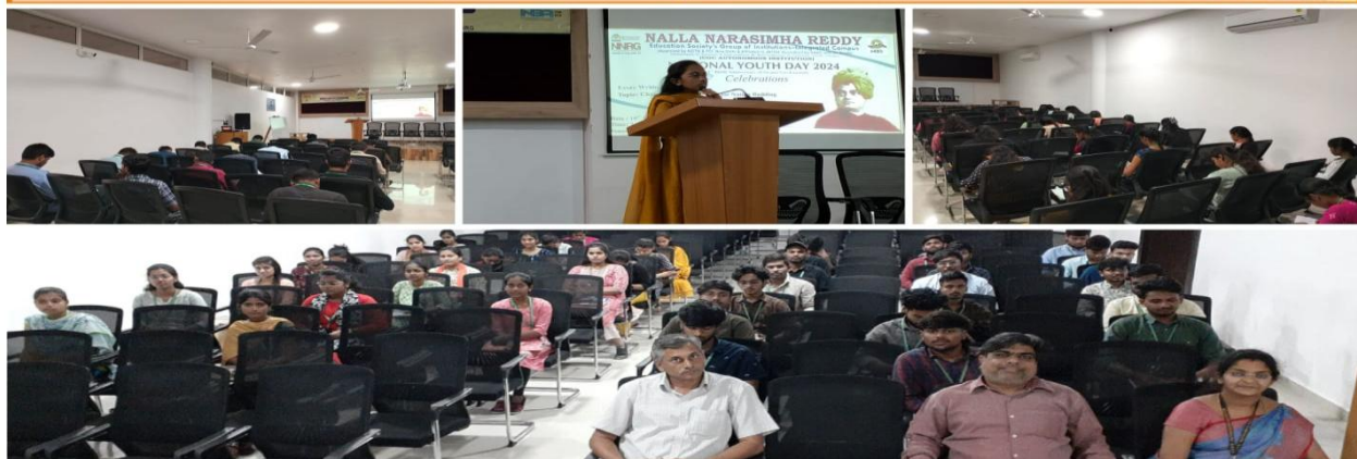
Faculty, Staff, and students of B. Pharmacy (33) have participated in the program on 10.01.2024.