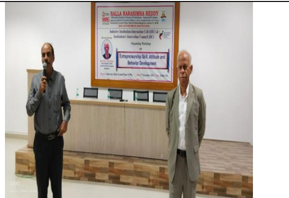
Addressing the IIC Convener and Dean SoMS in the event