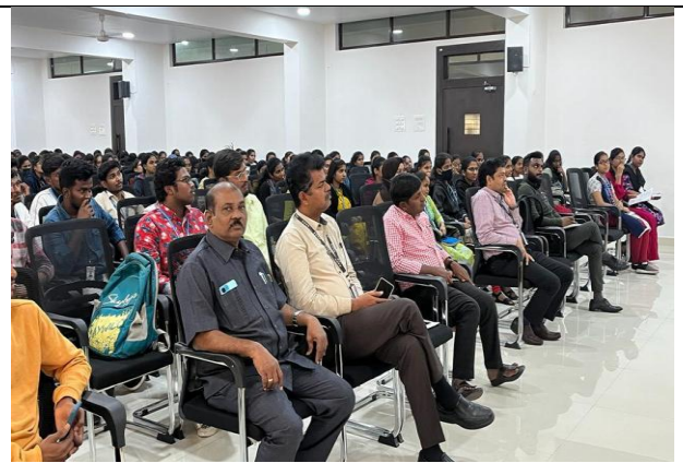
Faculty and participants in the event