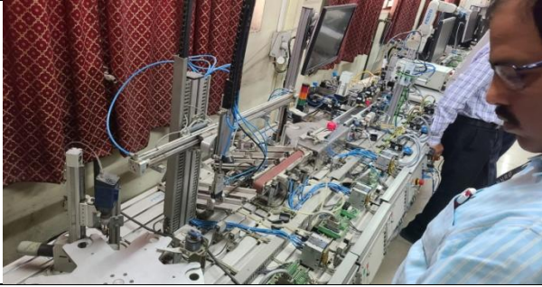
Industry Automation 4.0