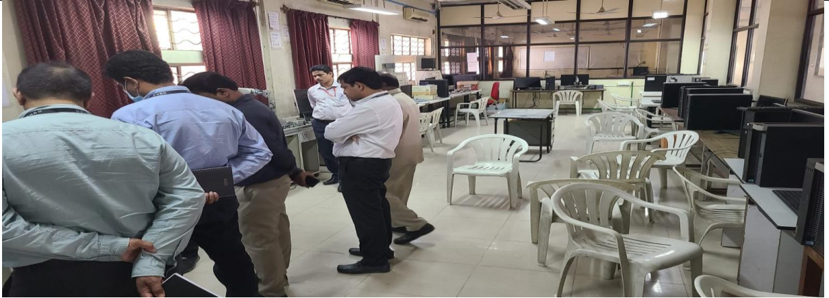
CITD officials are explaining about ROBOTICS & PLC LAB facilities

The CITD visit was commenced from 11.30 am and ended by 5.00 pm.