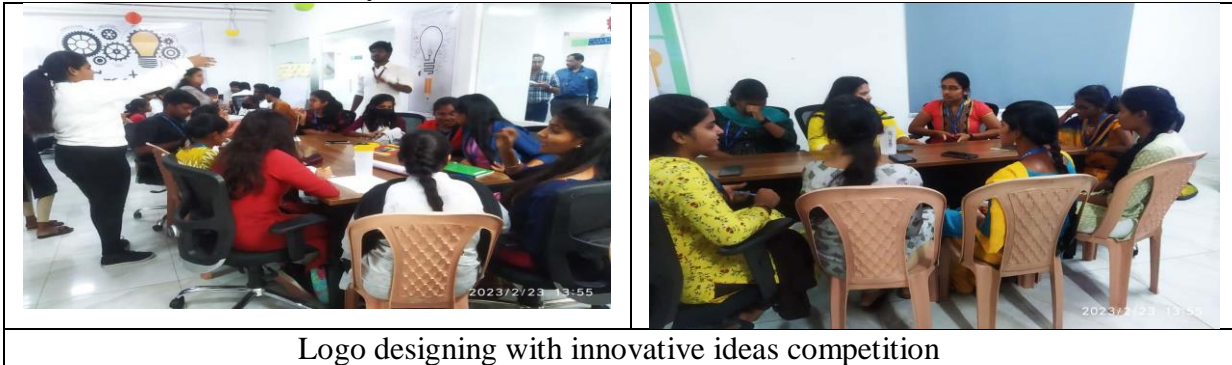
Logo designing with innovative ideas competition

13 students of various branches and 2 groups came out with good concepts of designing logos. All these students are rewarded with gifts. Following the NNRG students are performed well in designing with various logos and the details are: