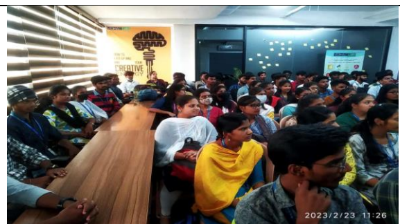
Students participation in Creative session