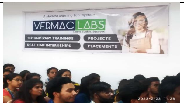
NNRG students at VERMAC LABS