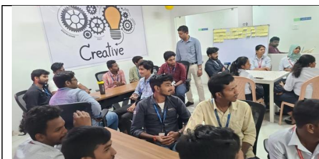
VERMAC LABS team explaining about startups