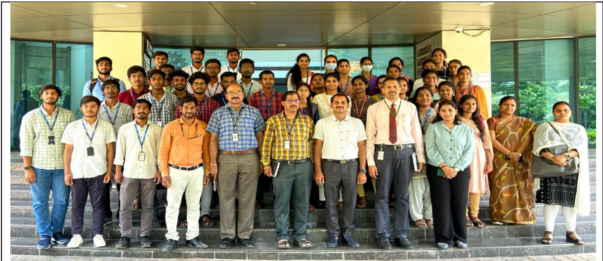
NNRG team and CCMB officials

He guided about role of engineering students in innovation in biological research. He gave practical insights of two incubated startups. He has given basic information about problem identification and seed funding agencies at CCMB. He offered internship opportunities for NNRG students.