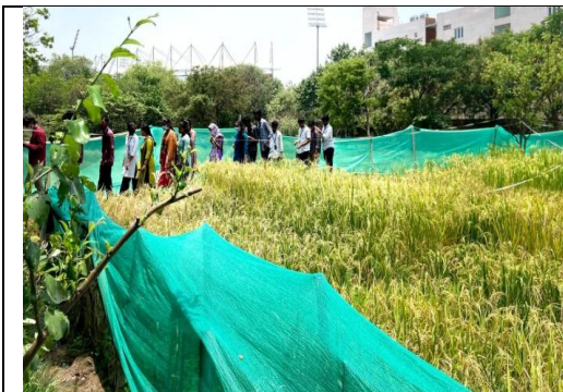
Agriculture field visit