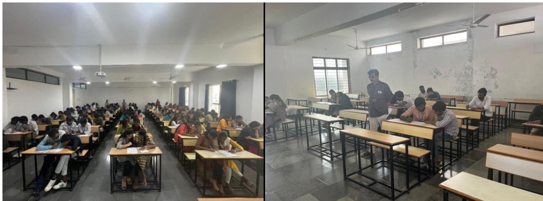
Students participating in Quiz competition