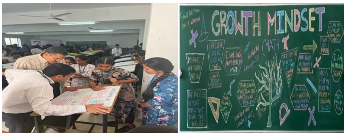
Judges visiting poster presentation competition