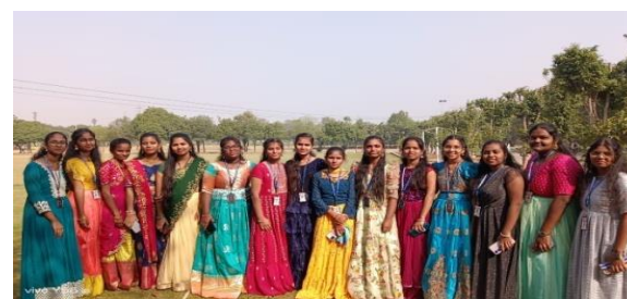
Students in the cultural activities on Fresher's Day