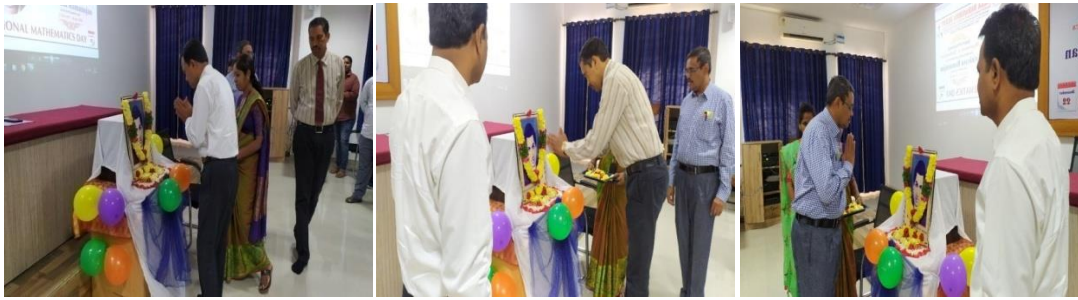
Garlanding the photo of Srinivasa Ramanujan