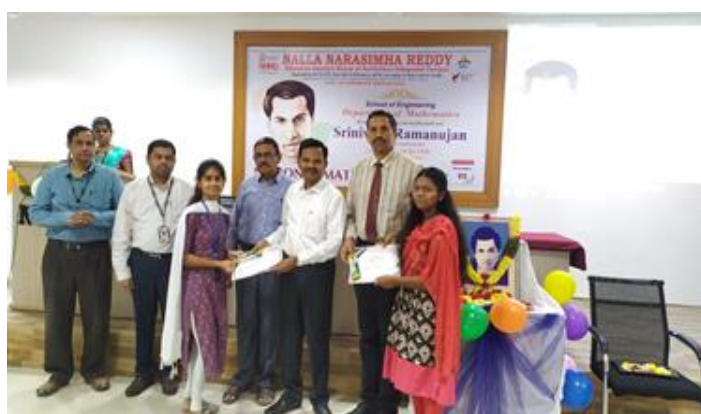
Prize distribution by the Director, Dean, and HODs