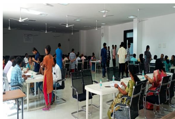
Faculty members speaking to the parents of I B.Tech students