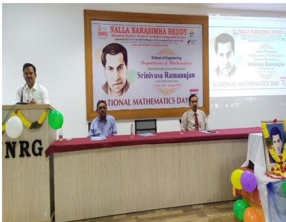
Director addressing the students