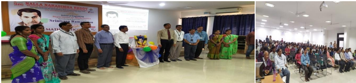
Mathematics faculty with the Director, Dean, and department heads