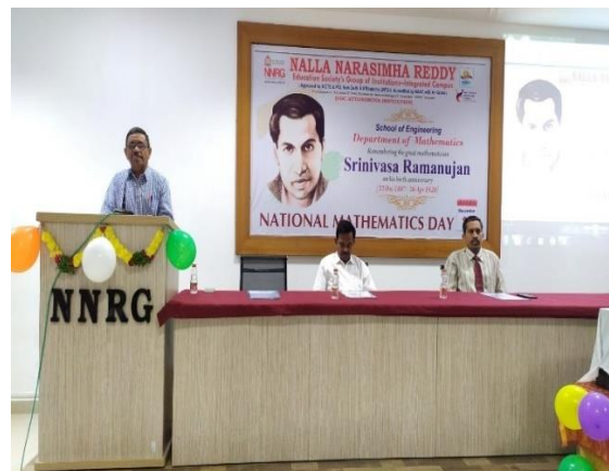
HOD (H&S) addressing the students