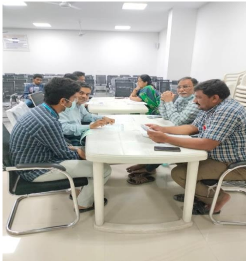
Faculty members interacting with the parents