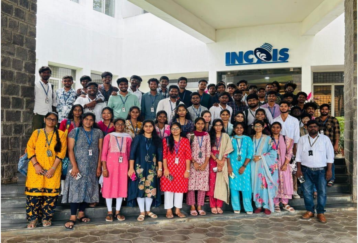
Students and Staff Group Photo at INCOIS

Such visits not only enhance technical knowledge but also inspire students to contribute to India's growth in the field of technology and space research.