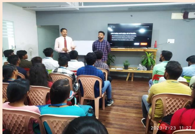
Dean of SOE, NNRG and the trainer of VERMAC LABS inaugurating the session

1. Industrial visit is arranged for the students of III CSE on 23-2-2023 to know the industry activities and to impact the knowledge of working scenario and about real time applications. The students and trainers are interacted each other and students clarified their doubts on upcoming technologies. With this visit and interaction Students had an idea how to get job and how to work as team in real time scenario.