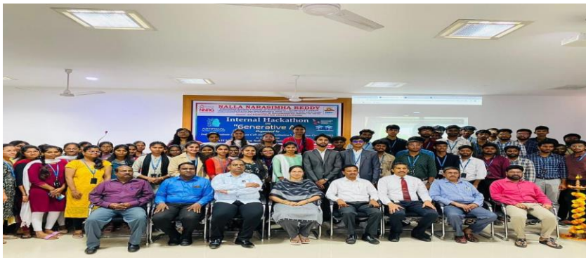
Participants with faculty coordinators