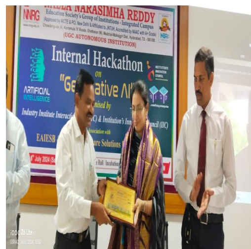
Few glimpses from inauguration