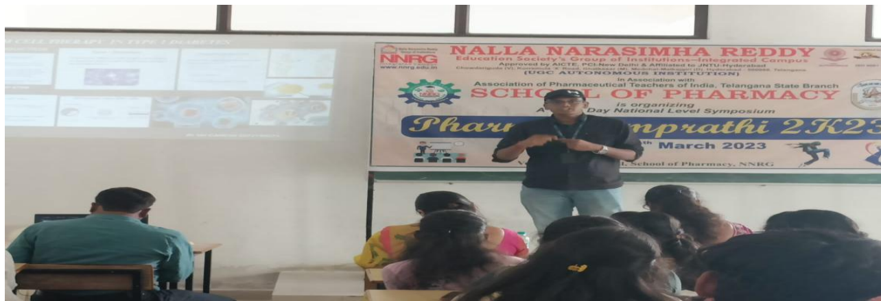
Student Presenting e-Poster

e-Posters (Electronic Poster) of Research work and reviews in the respective interested subjects were presented by the participants. Total 35 participants from B.Pharmacy, M.Pharm, Pharm D, Research Scholars and Faculty presented their content as e-poster on multiple topics and the presentations were evaluated by the experts. A template was provided by the coordinators well in advance for the preparation of e-posters . The e-posters were evaluated in the seminar hall.