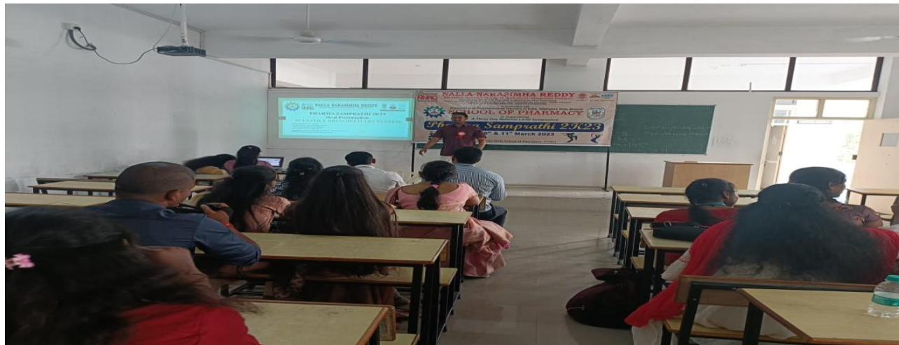
Oral Presentation and assessment

Total 40 participants actively presented their presentations on multiple topics. The presentations were evaluated by the experts of Pharmacy Education.