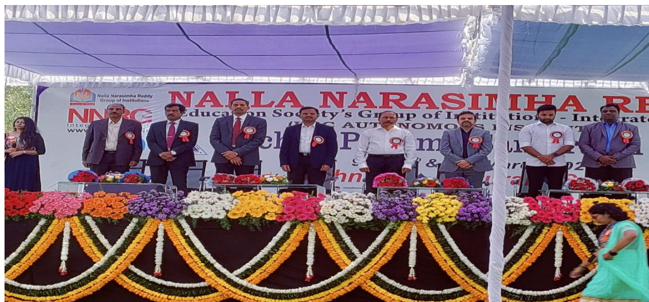
Inaugural of Pharmasamprathi 2023