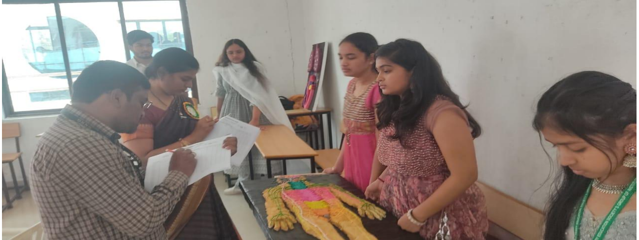
Students presenting Live Models

The second day was continued with oral, e-poster. Along with this live Model presentation and Quiz were conducted. Live Models broadcast structural and physical mode of presentations which enlightens the technical and creative skills of the students. live models were prepared and presented by the students, where their technical knowledge and creative skills were analyzed and assessed.