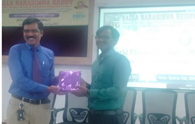
Faculty, Staff, of B. Pharmacy (360) have participated in the program