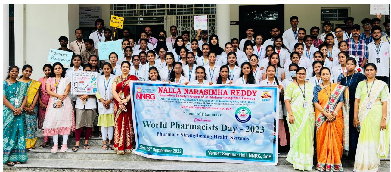
Faculty, Staff, of B. Pharmacy IV year (90) have participated in the program