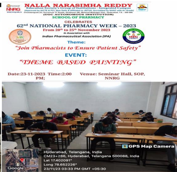
Theme Painting Competition