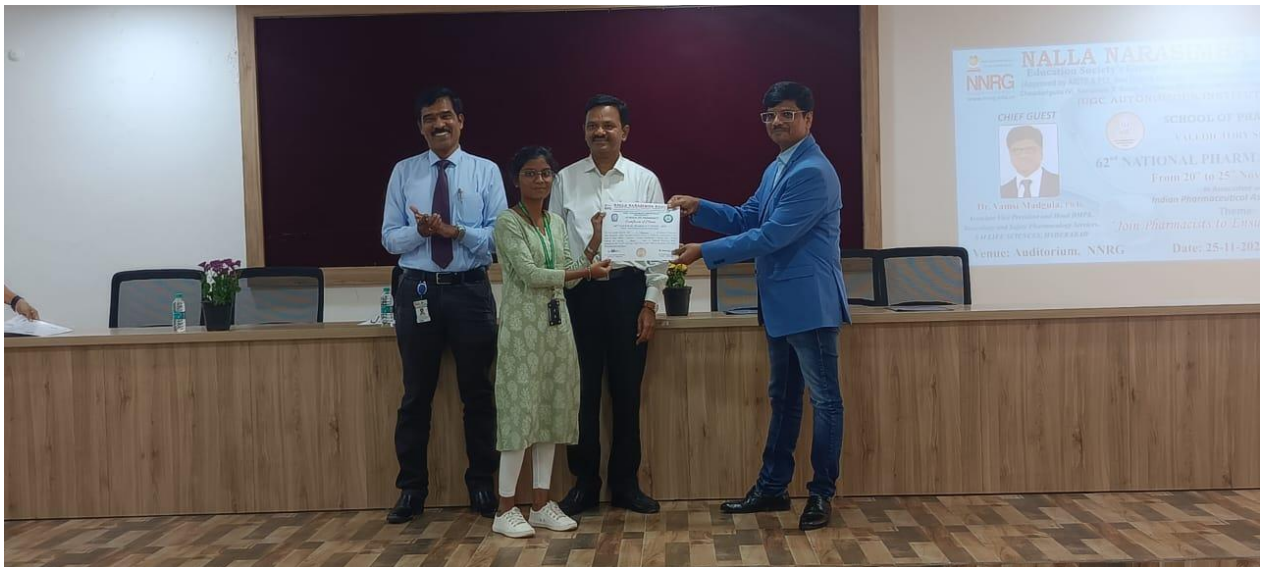
Students were appreciated with awards for succeeding in the competitions by the chief guest at NPW-2023

DEAN NNR School of Pharmacy Nalla Narasimha Reddy Education Society's Group of Institutions Chowdariguda, Korremula X Roads, Ghatkesar Mandal, Medchal Dist-500 088