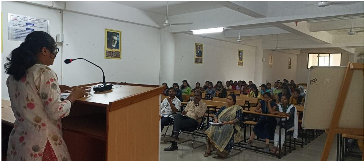
Students participating in Elocution