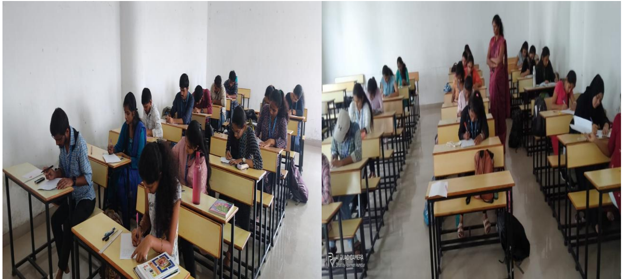
Students participating in Essay Writing Competition