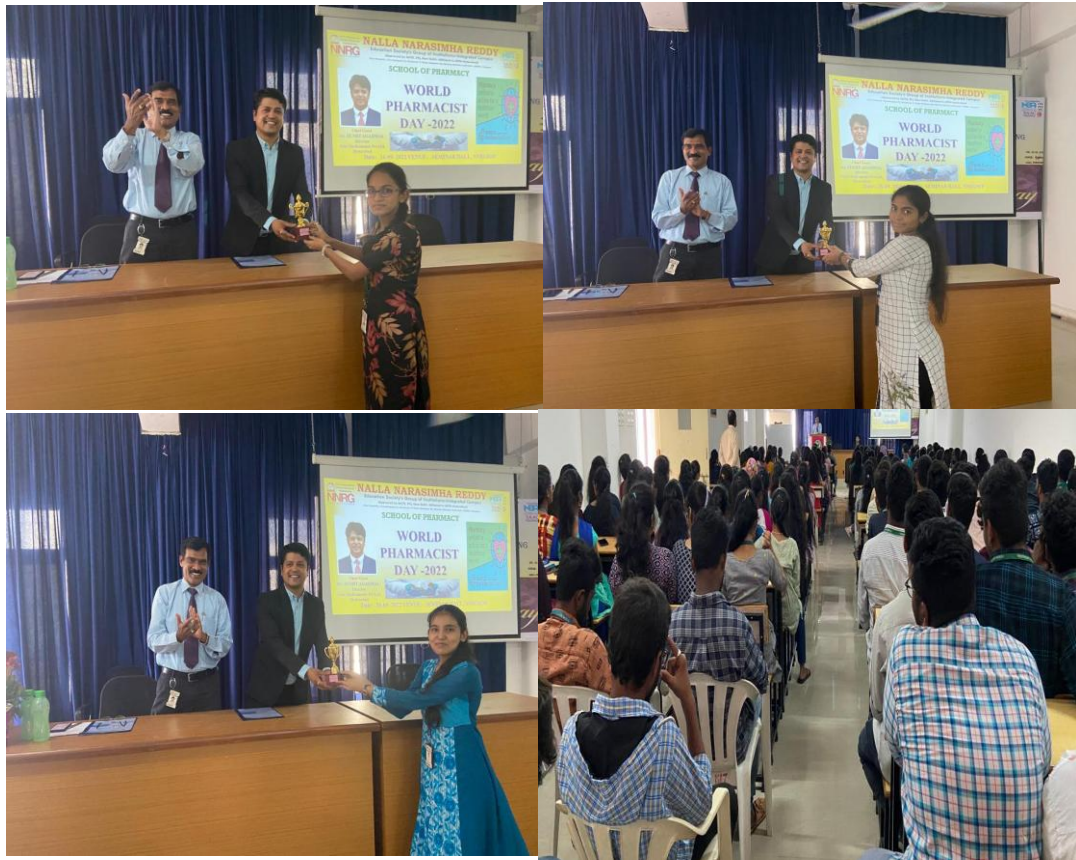
Dignitaries presenting prizes to the winners