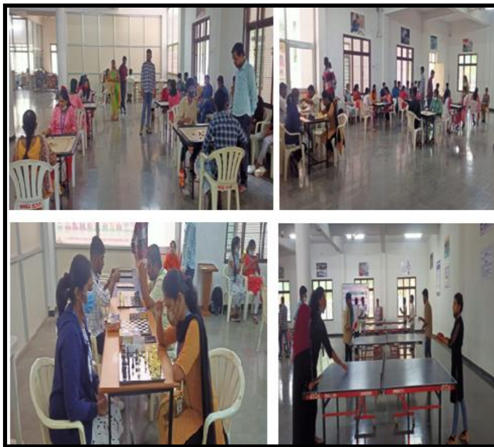
Students participating in Indoor Games Competition at NPW-2021