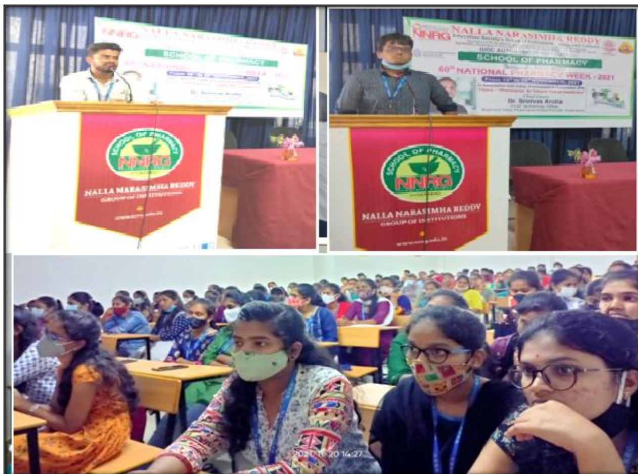
Students participating in Elocution Competition at NPW-2021

The event was indeed astounding to see how beautifully students had put their thoughts, insights and delivered the speech with consciousness. Their speech was fluent, erudite and articulate though it was unscripted and the participants won the hearts of the judges and the audiences with their confidence, expression, talent and presentation skills.