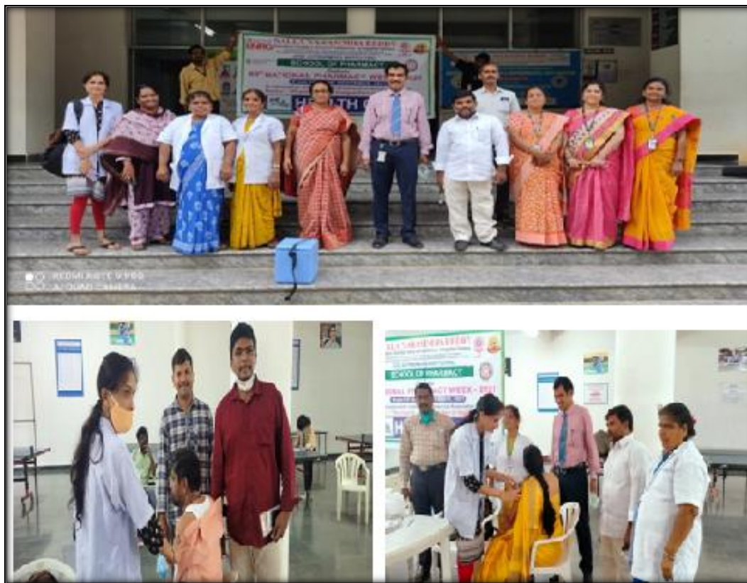
Vaccination drive in association with PHC, Narapally at NPW-2021