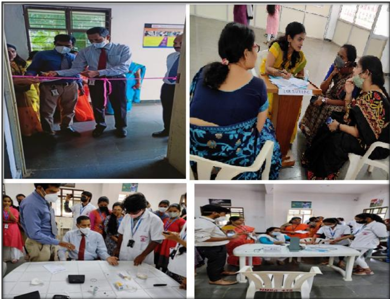
Inaugural, counseling and student participating at Indoor health camp at NPW-2021