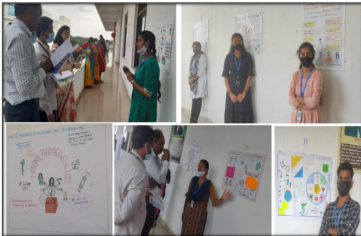
Students participating in Poster Presentation Competition at NPW-2021

Evaluation was done based on preparation of poster, content of the theme covered, presentation skills, body language and defense as criterions. Students expressed their in-depth knowledge on different aspects of how Pharmacists serve the society in different sectors of Pharmacy health care system and also his top priority role as a front line warrior during pandemic, his contribution in the research and development of COVID vaccine.