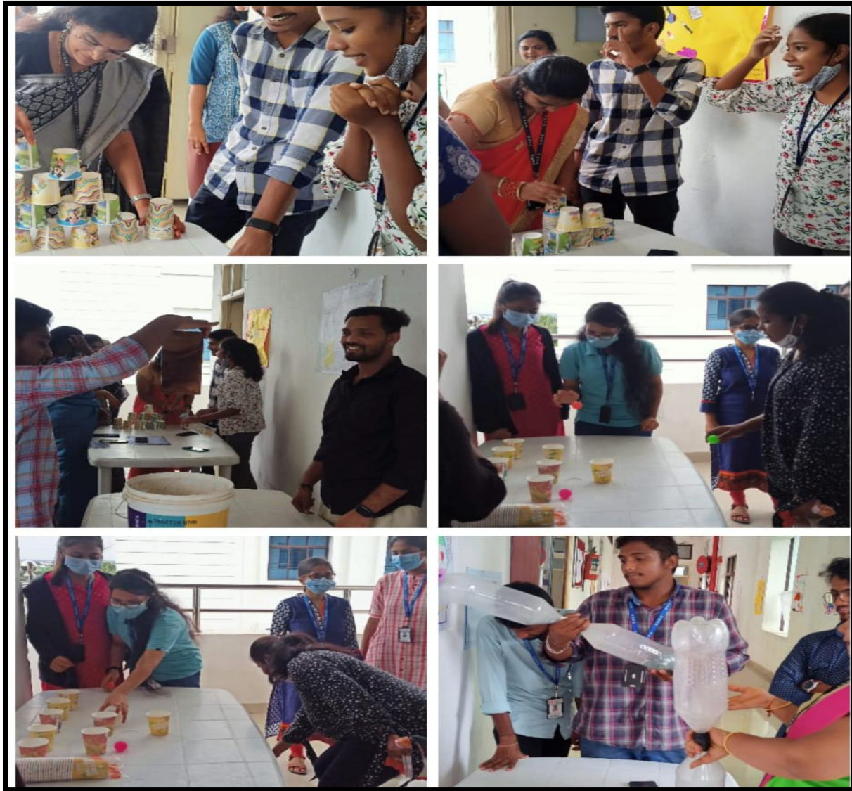
Students participating in fun games at NPW-2021