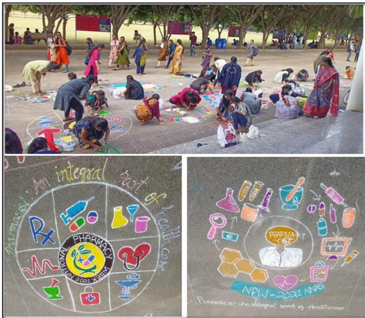
Students participating in Rangoli Competition at NPW-2021

Rangoli is an ancient art that is followed all over India. It refers to row of colors. In order to develop skills of aesthetics, creativity & innovation among the students rangoli competition was organized. Students have shown their creativity by including logos, symbols & images related to Pharmacy field and NPW-2021 theme. The students awarded prizes based on overall aesthetic appearance, design, theme, details, clarity in art, color combination, creativity and idea presentation.