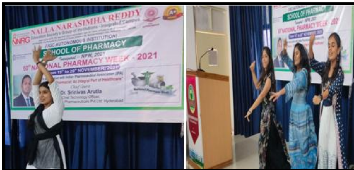
Students participating in Cultural Competition at NPW-2021

The students were overwhelmed during cultural event. They enjoyed thoroughly and came forward for singing and dancing. The session continued till 12:30 PM