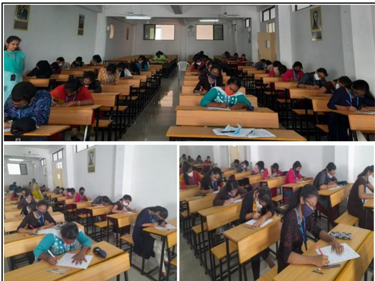
Students participating in Essay Writing Competition at NPW-2021

Criterion parameters for evaluating the essay writing: Organization of the ideas, content (Introduction, main body and conclusion), language, vocabulary, quality of content, hand writing & connecting the content to given theme. Students were given a time limit of 30 minutes to complete their essay.