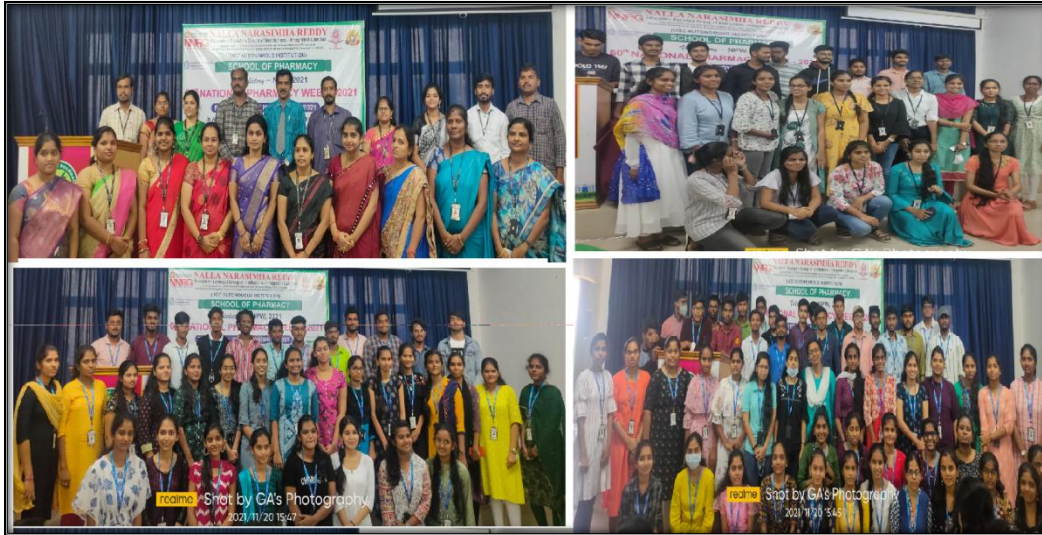
Students and faculty groups participated at NPW-2021 Valedictory