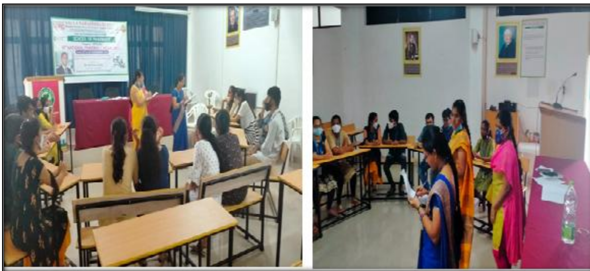
Students participating in Quiz at NPW-2021