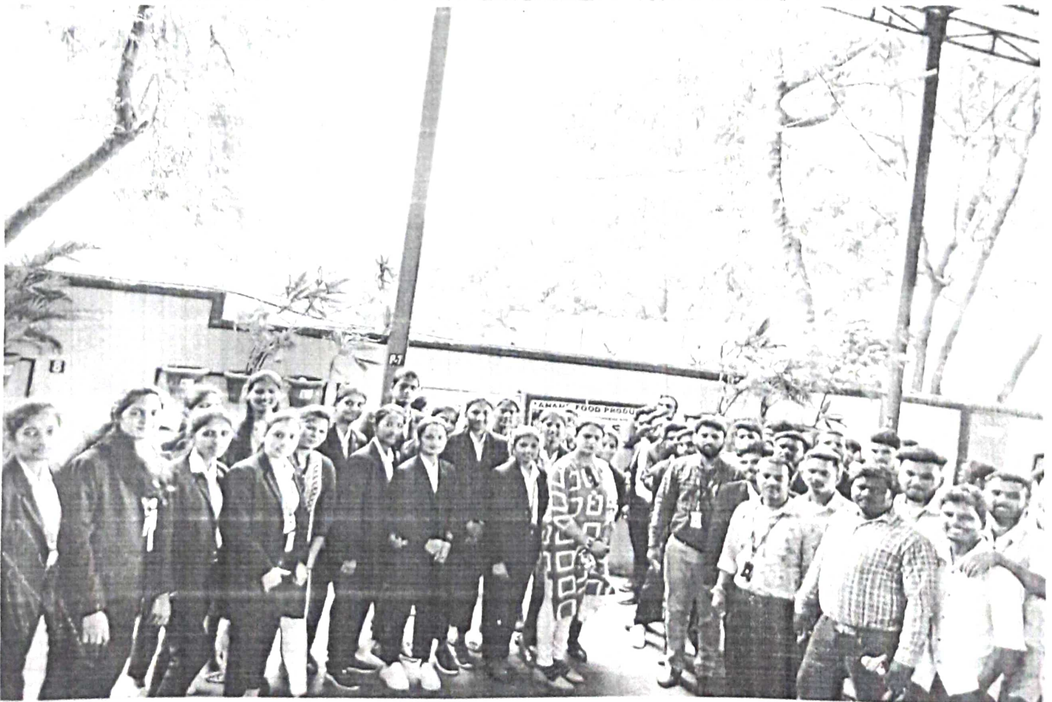
Industrial Visit to Anand Food Products (Parle) on 17 th June 2023