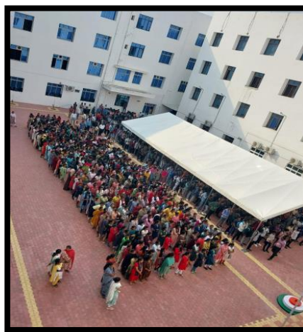
Courtyard with all the Students and Faculty