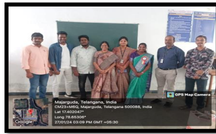
Year wise Group photo 2018-2022