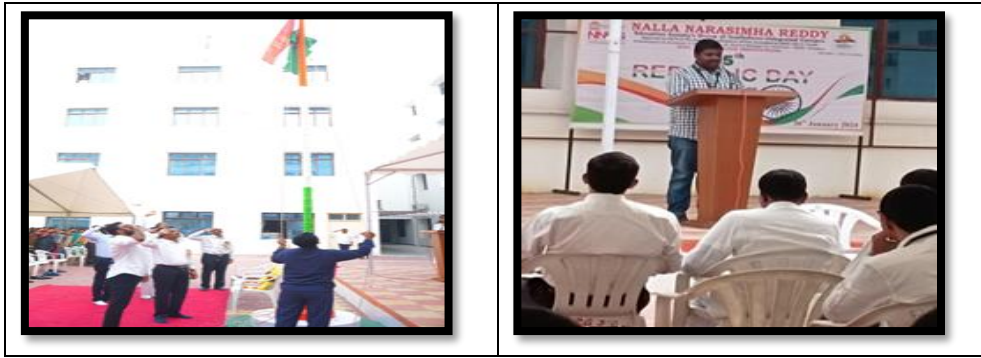
Glimpses of Republic Day celebrations