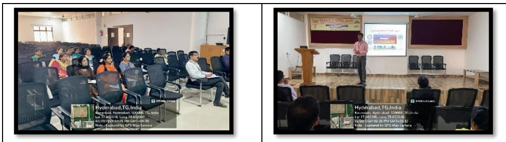
Glimpses of workshop