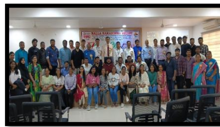
Alumni with dignitaries