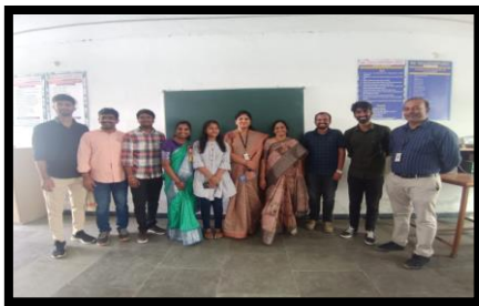
Year wise Group photo