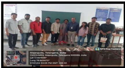
Year wise Group photo 2019-2023