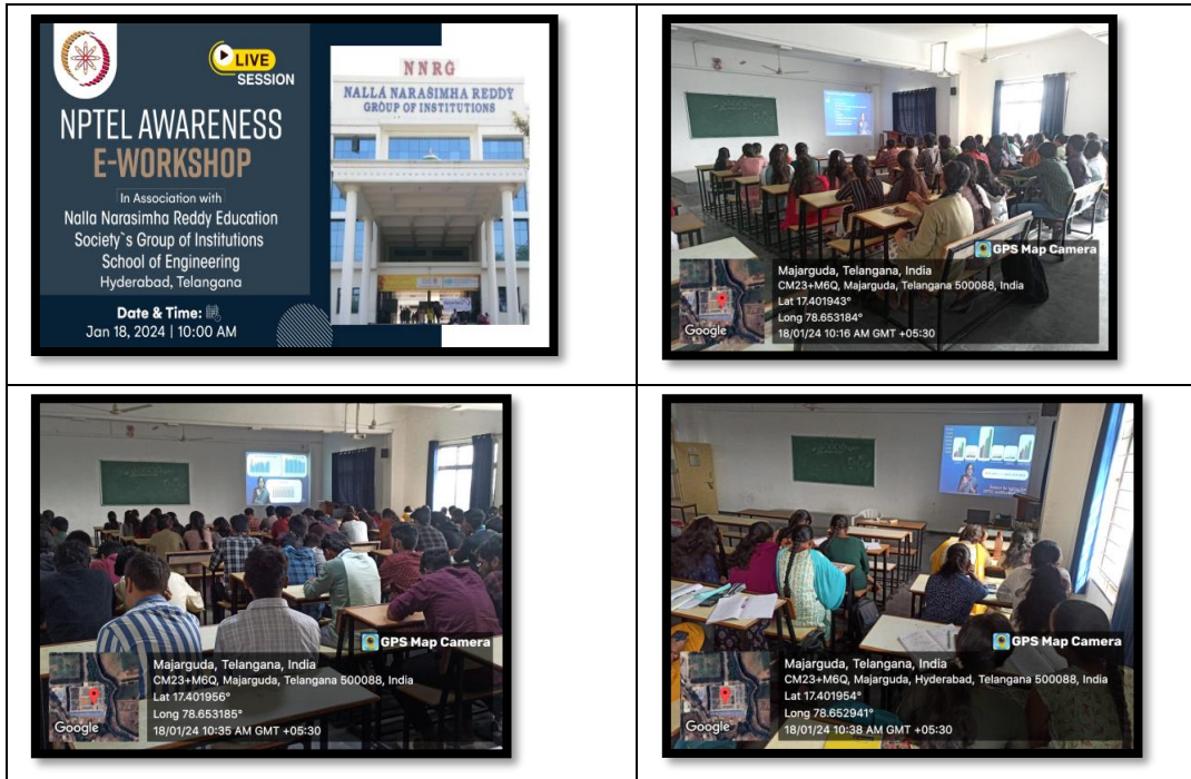
Glimpses of NPTEL E-Awareness