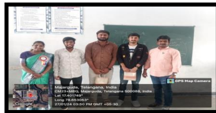
Year wise Group photo 2019-2023