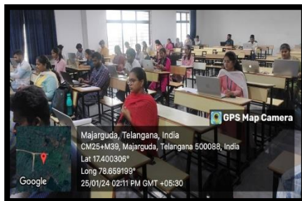
Assessment test at the end of the training program.