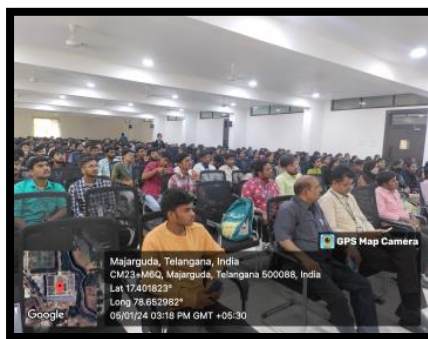
Students and Faculty listening to the speaker