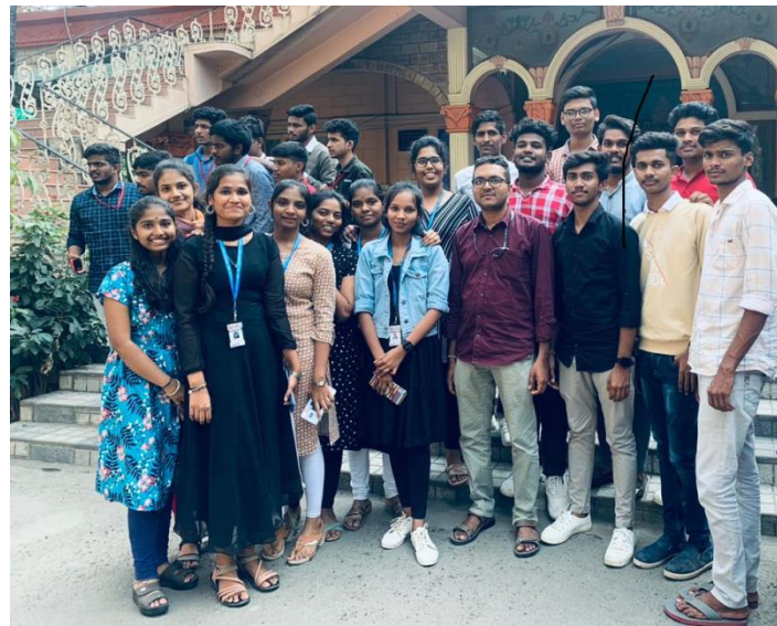
Students & Faculty of NNRG at Ramakrishna Math