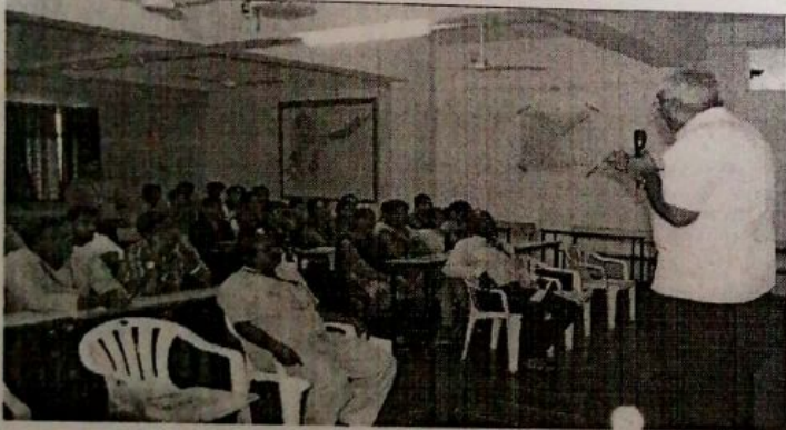
Interaction programme during the Guest Lecture