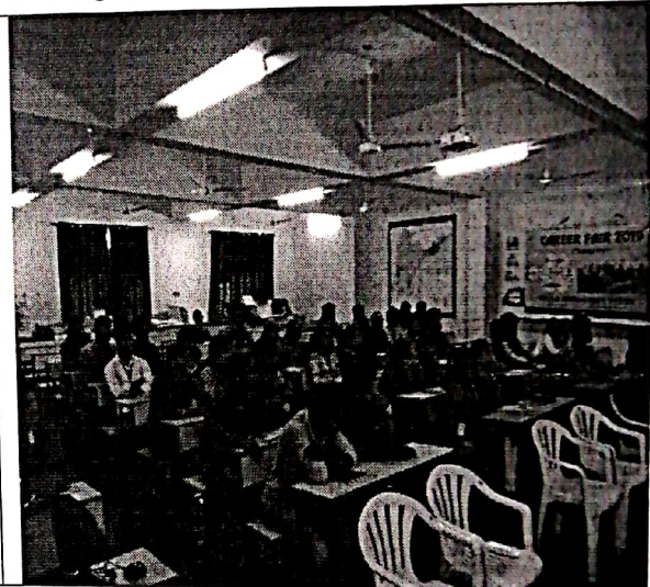
Students and faculty in the session

Head of the Department Civil Engineering Group of Institutions - Bangalore 2017