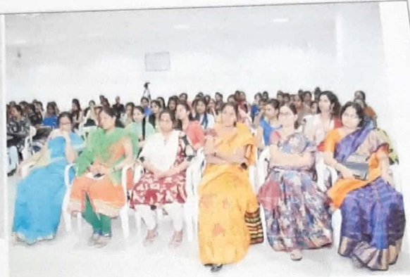
Girls & Women Faculty of NNRG