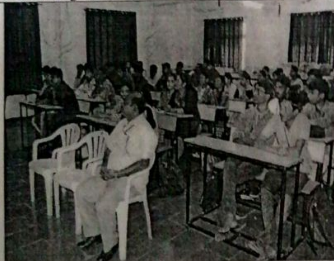
Students listening the impornance of DGPS which are given by GVR Tagore