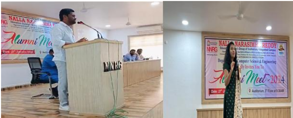
CSE Alumni addressing in the ALUMNI MEET 2024