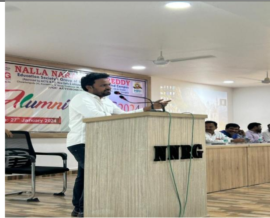
Alumni interaction with the IV & III year Pharmacy students