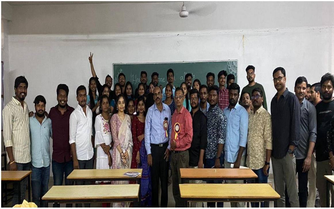
ALUMNI GROUP PHOTO with MBA DEPARTMENT Faculty