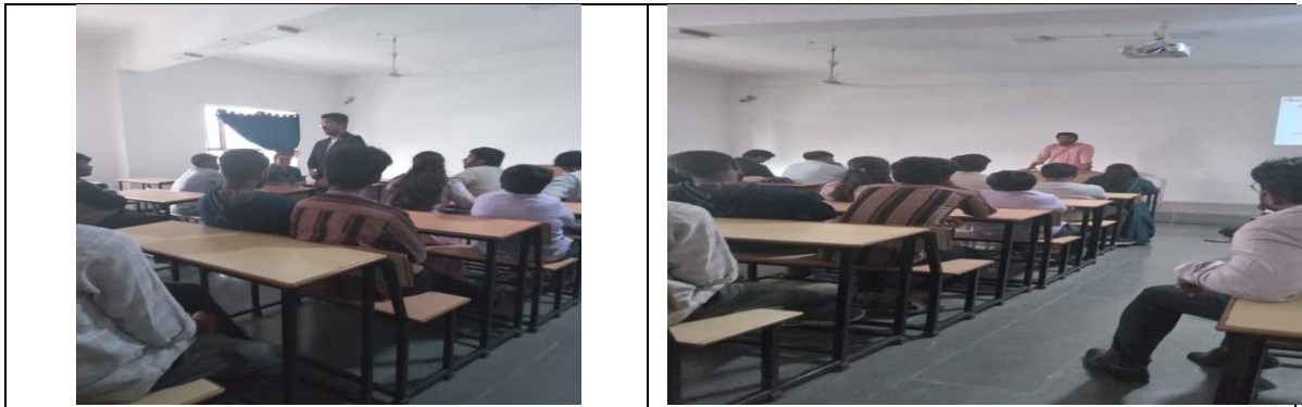
EEE Alumni interaction with the IV & III year EEE students