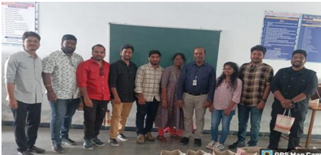
ALUMNI GROUP PHOTO with ECE Dept Faculty