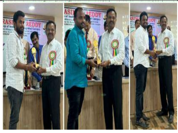
Mementoes to the Pharmacy Alumni