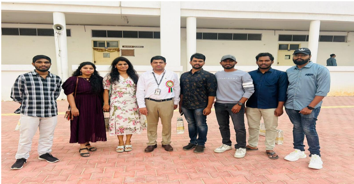
ALUMNI GROUP PHOTO with CSE Dept HEAD