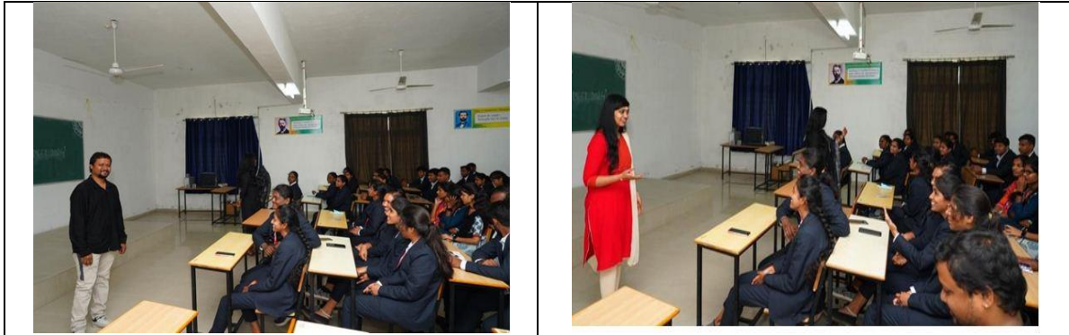
MBA Alumni interaction with the II & I year MBA students