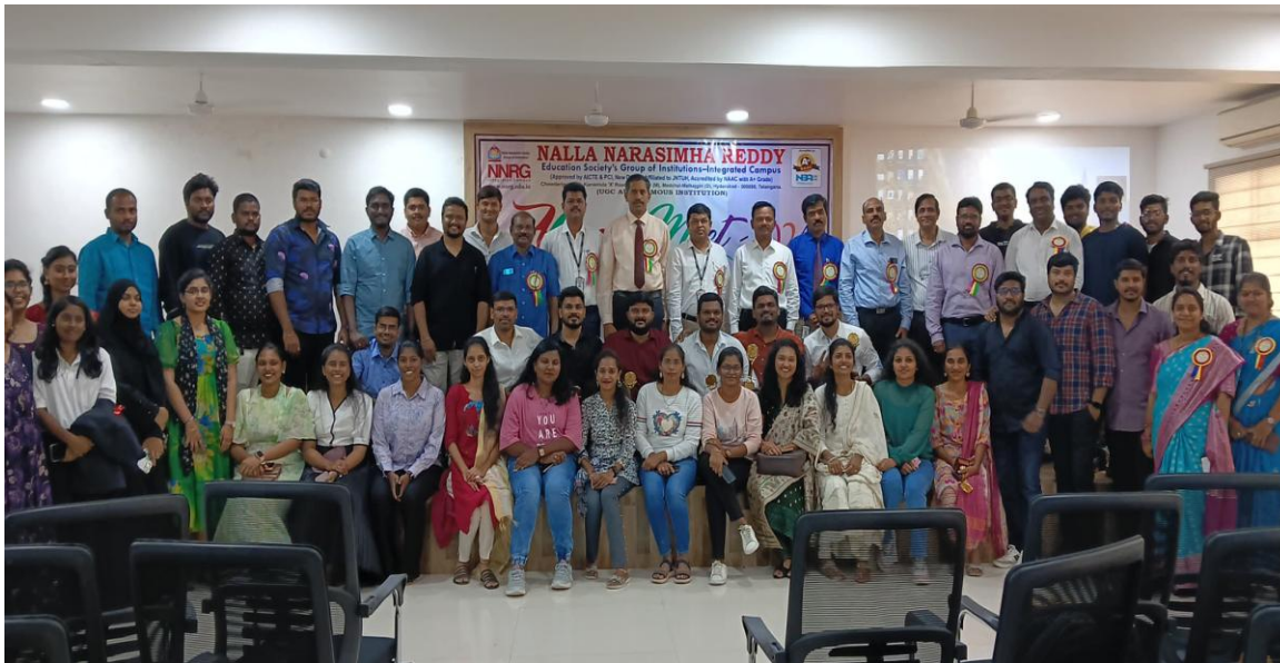
Alumni Group photo with the Director, Deans, HoDs, Faculty on 27-01-2024

A few alumni highlighted along with the following suggestions to the NNRESGI students regarding their career: