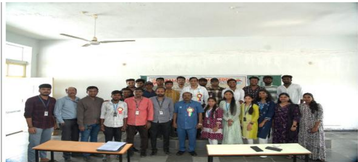
Alumni, Student Coordinators and Faculty of Civil Engineering in the Alumni Meet - 2024