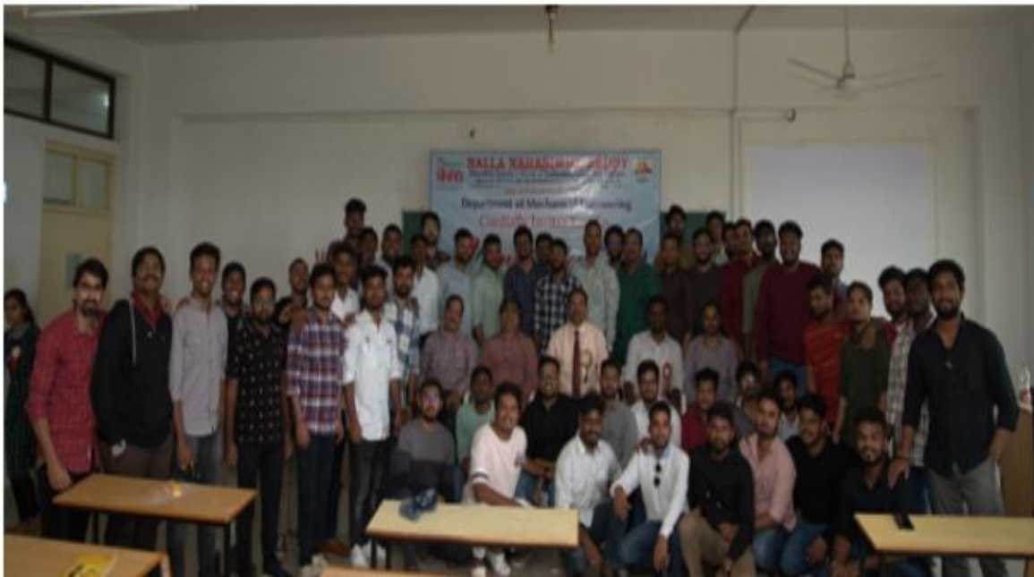
ALUMNI GROUP PHOTO with Mechanical Dept Faculty