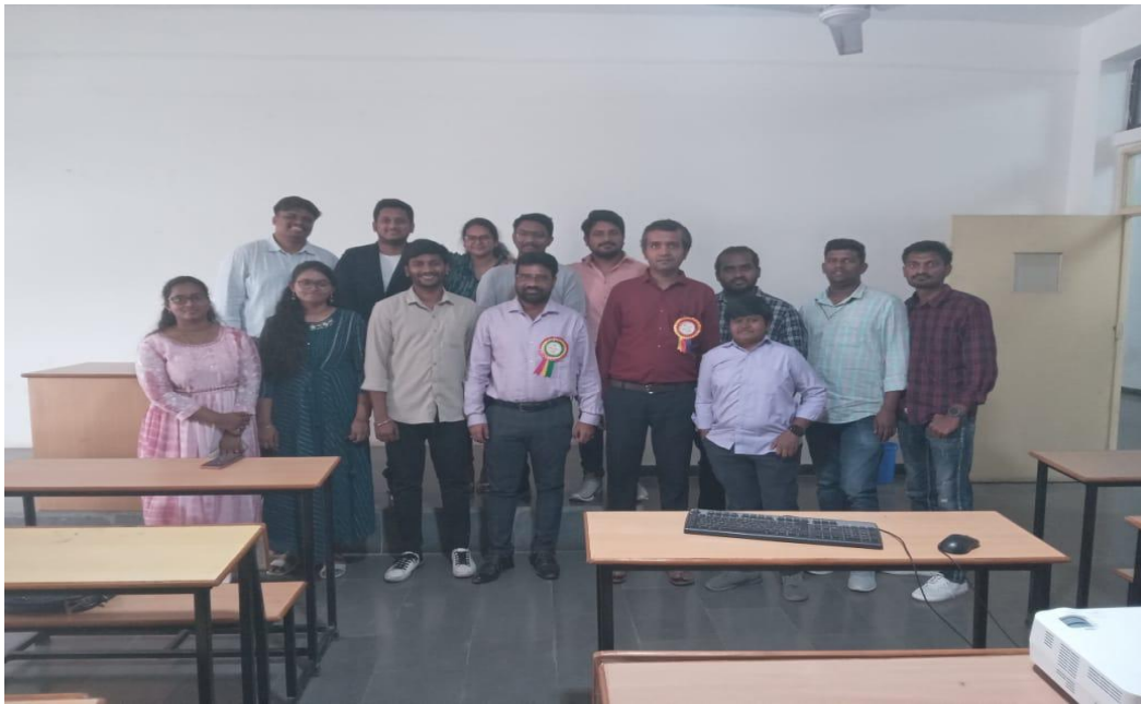
ALUMNI GROUP PHOTO with EEE Dept Faculty