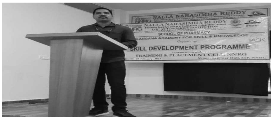
Training and Placement coordinator, NNRGSOP, Introducing the speaker to the students.