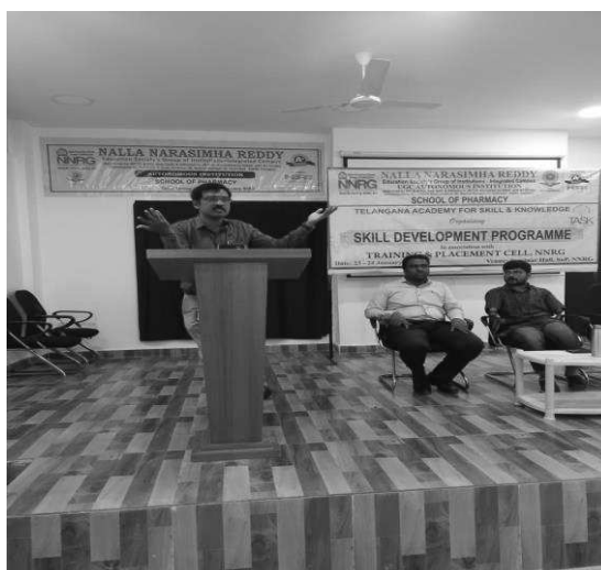
Dean, NNRGSOP addressing students