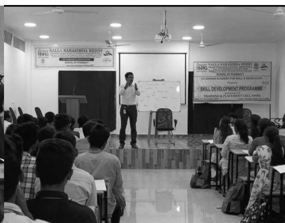
Dean, NNRGSOP, giving a vote of Thanks