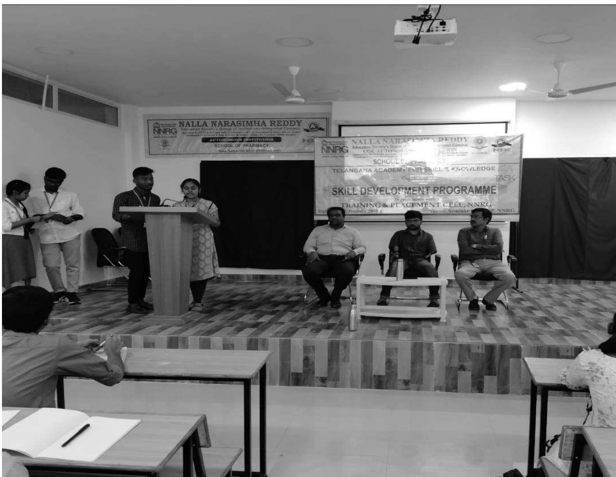
Students Introducing Speaker