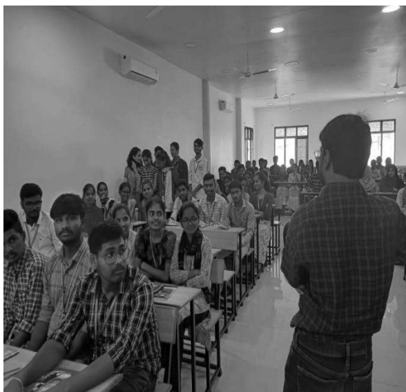
Students participating in group activities during TASK session.