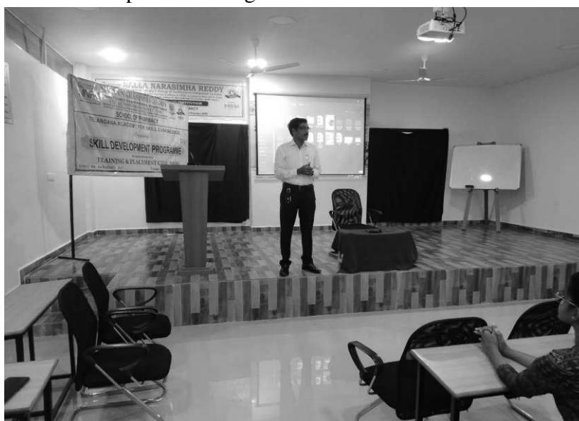
Dean, NNRGSOP, giving a vote of Thanks.