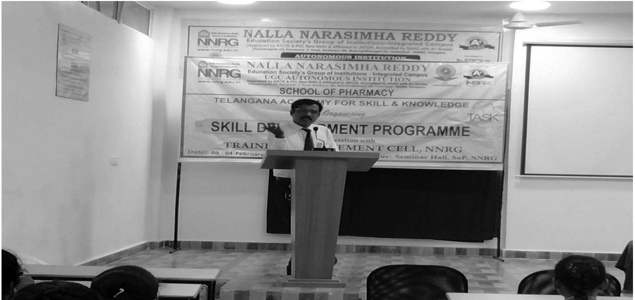
Dean, NNRGSOP, giving vote of Thanks.