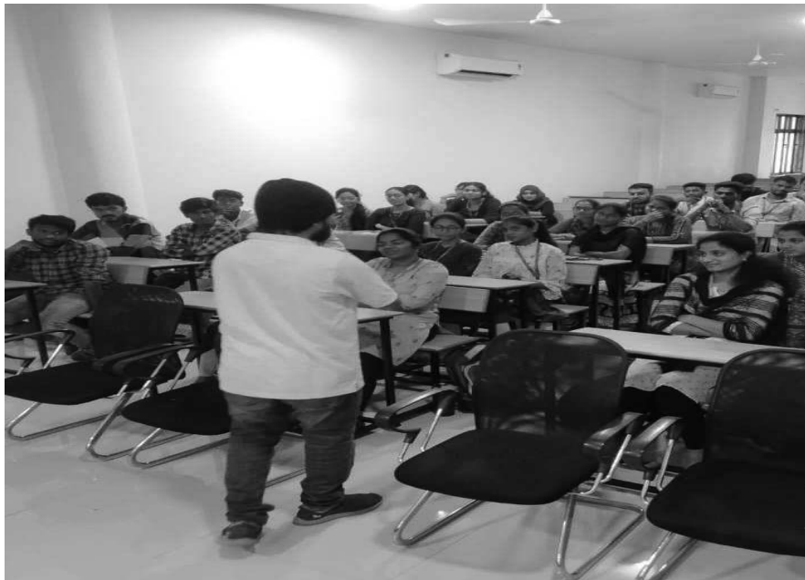
Speaker Taking Classes to the Students