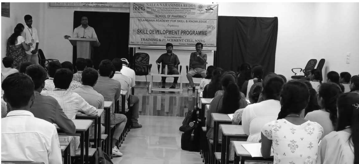
TPO, NNRG addressing students